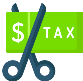
Tax Implications to location